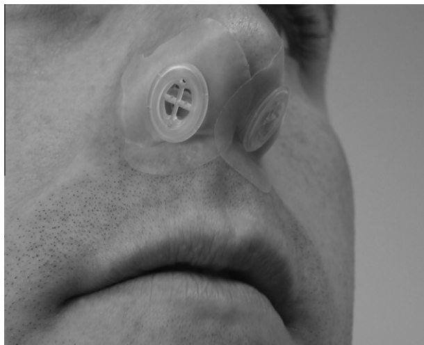
Fig. 1. Photograph of the EPAP device in place.

OSA who, within the past 5 years, had refused CPAP treatment, discontinued CPAP, or had been minimally adherent with CPAP, or defined as reported use less than 3 h per night. On screening/baseline PSG patients were required to have an AHI > 15, or AHI > 10 with evidence of excessive daytime sleepiness, impaired cognition or mood, or hypertension. Exclusion criteria included persistent blockage of one or both nostrils, frequent and/or poorly treated severe nasal allergies or sinusitis, use of any device that interfered with nasal or oral breathing, chronic sores or lesions of the nose, chronic use of nasal decongestants other than nasal steroids, severe respiratory or cardiovascular disorders, severe cardiac rhythm disturbance, pathologically low blood pressure, sleep disorders other than OSA, psychiatric disorder with psychotic features, work schedule which included night shift, excessive caffeine consumption, and pregnancy.